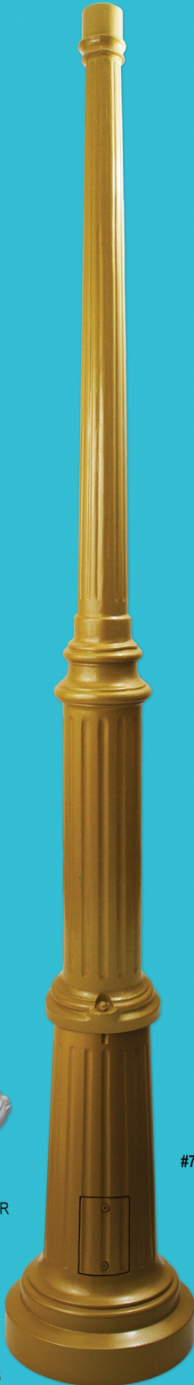
#7800 Series (Smooth Top)