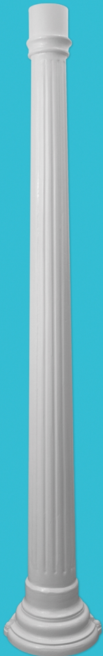
#6504 Ht 3' 10" Base Dia 7 3/4" Also available w/ CLR 3 3/8" Bolt Circle