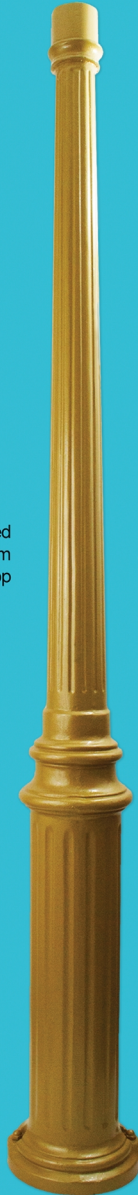
#6506 Ht 5' 8" Base Dia 8" Also available w/ CLR 3 3/8" Bolt Circle