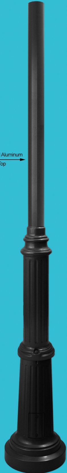
#8700 Series (Fluted Top) *