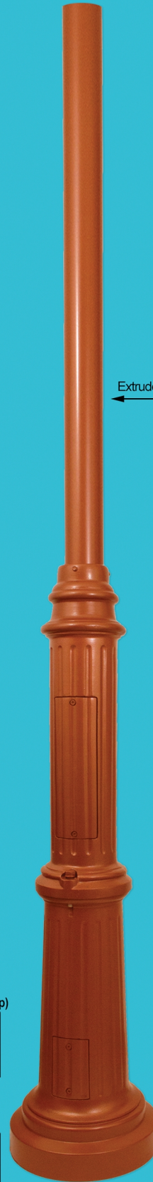
#8800 Series (Smooth Top) *