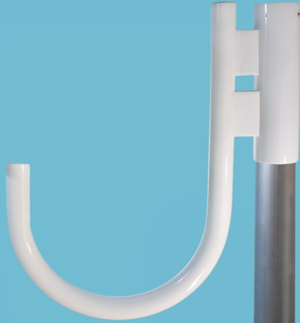
Cat# 1959 Ht. 25 1/2" Ext. 20" 3" Post Fitter