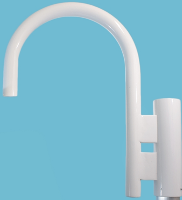
Cat# 1963 Ht. 25 1/2" Ext. 20" 3" Post Fitter

These wall brackets are made from 1 1/2" Sch 40 pipe. They measure almost 2" in diameter. Custom sizes and configurations available.