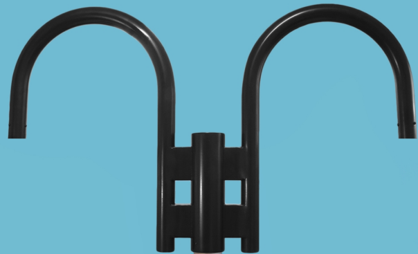
Cat# 1961 Ht. 25 1/2" Ext. 40" 3" Post Fitter