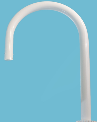
Cat# 1962 Ht. 28" Ext. 19" 3" Post Fitter