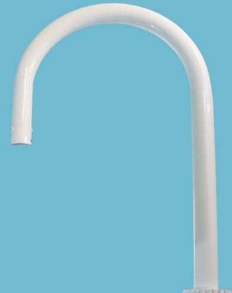
Cat# 1962 Ht. 28" Ext. 19" 3" Post Fitter