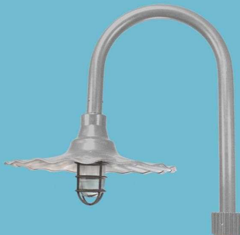
Cat# 30/20WG-1962 Ht. 28" Ext. 29 1/2" Dia. 20" 16" Dia. available 3" Post Fitter

All fixtures are available in: Incandescent(standard), Metal Halide, High Pressure Sodium, PL, & LED. Pick from any of our standard powder coated colors. See Powder Coated Color Chart. Custom colors on request. Other shades are available- see page 3B of this section.