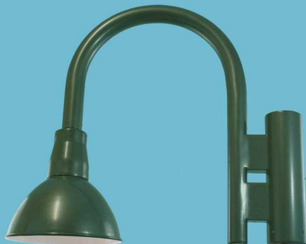
Cat# 41/12-1963 Ht. 25 1/2" Ext. 26" Dia. 12" 14", 16", 18" Dia. available 3" Post Fitter

Extra thick gooseneck arms with extra-large shades. These arms are almost 2" in diameter. All aluminum construction.