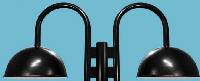
Cat# 39/19-1961 Ht. 25 1/2" Ext. 59" Dia. 19" 23" Dia. available 3" Post Fitter