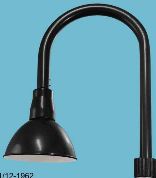
Cat# 41/12-1962 Ht. 28" Ext. 25" Dia. 12" 14", 16", 18" Dia. available 3" Post Fitter