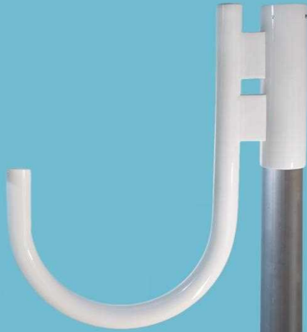
Cat# 1959 Ht. 25 1/2" Ext. 20" 3" Post Fitter