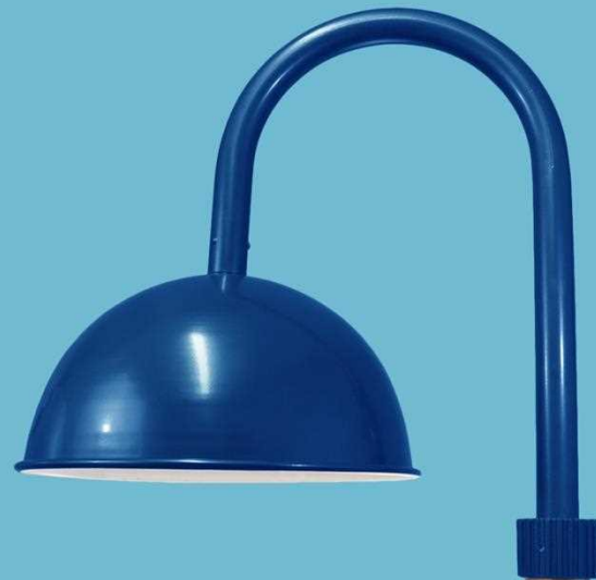
Cat# 39/19-1962 Ht. 25 1/2" Ext. 28 1/2" Dia. 19" 23" Dia. available 3" Post Fitter