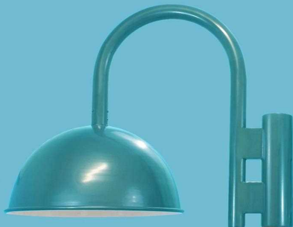
Cat# 39/19-1963 Ht. 25 1/2" Ext. 29 1/2" Dia. 19" 23" Dia. available 3" Post Fitter

Extra thick gooseneck arms with extra-large shades. These arms are almost 2" in diameter. All aluminum construction.