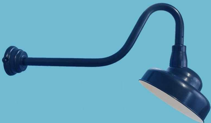
Cat# 19/16-957 Ht. 27" Ext. 43" Dia. 16" Max 300 Watt Incandescent

Extra thick gooseneck arms with extra-large shades. These arms are almost 2" in diameter. All aluminum construction.