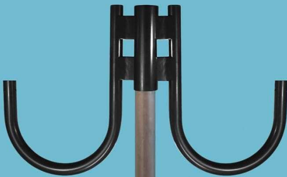
Cat# 1960 Ht. 25 1/2" Ext. 40" 3" Post Fitter