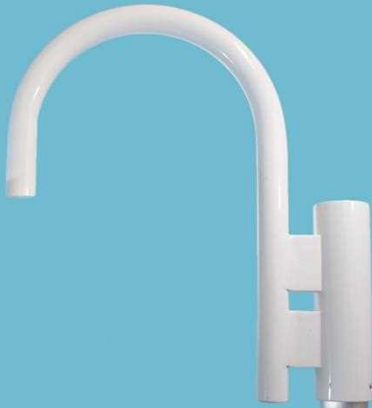
Cat# 1963 Ht. 25 1/2" Ext. 20" 3" Post Fitter

These wall brackets are made from 1 1/2" Sch 40 pipe. They measure almost 2" in diameter. Custom sizes and configurations available.