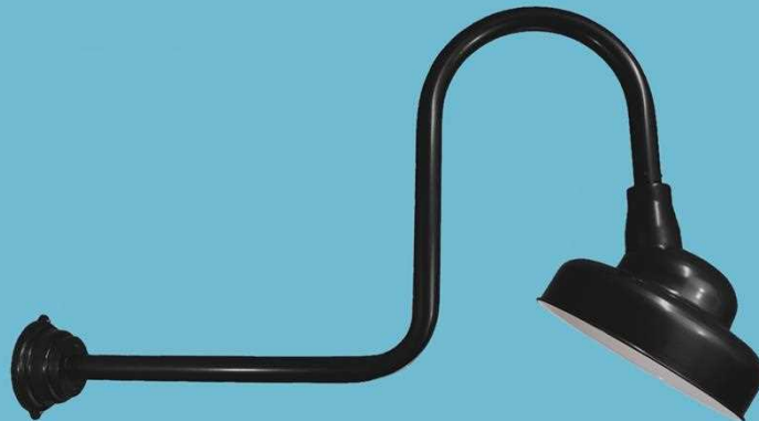
Cat# 19/16-951 Ht. 32" Ext. 52" Dia. 16" Max 300 Watt Incandescent