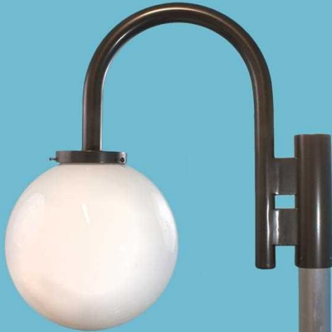
Cat# 1286N/3-1963 Ht. 30 1/2" Ext. 28" Dia. 16" 18", 20", 22", & 24" Dia. available 3" Post Fitter

Extra thick gooseneck arms with extra-large shades. These arms are almost 2" in diameter. All aluminum construction.