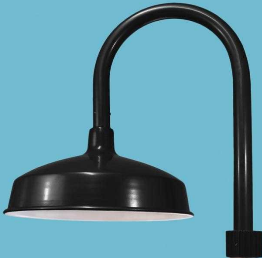
Cat# 23/19-1962 Ht. 25 1/2" Ext. 28 1/2" Dia. 19" 24" Dia. available 3" Post Fitter