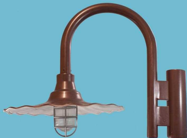
Cat# 30/20WG-1963 Ht. 25 1/2" Ext. 30" Dia. 20" 16" Dia. available 3" Post Fitter