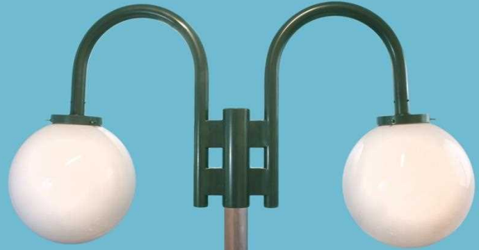
Cat# 1286N/3-1961 Ht. 30 1/2" Ext. 56" Dia. 16" 18" - 24" Dia. available 3" Post Fitter