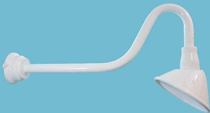
Cat# 20/12-957 Ht. 25" Ext. 41" Dia. 12 1/2" Max 200 Watt Incandescent