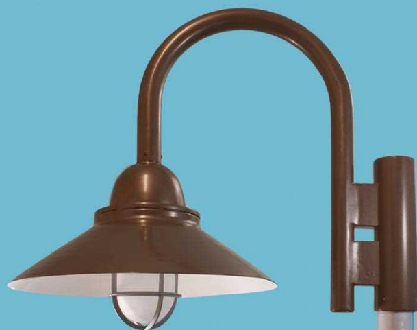
Cat# 423/20WG-1963 Ht. 25 1/2" Ext. 30" Dia. 20" 16" Dia. available 3" Post Fitter