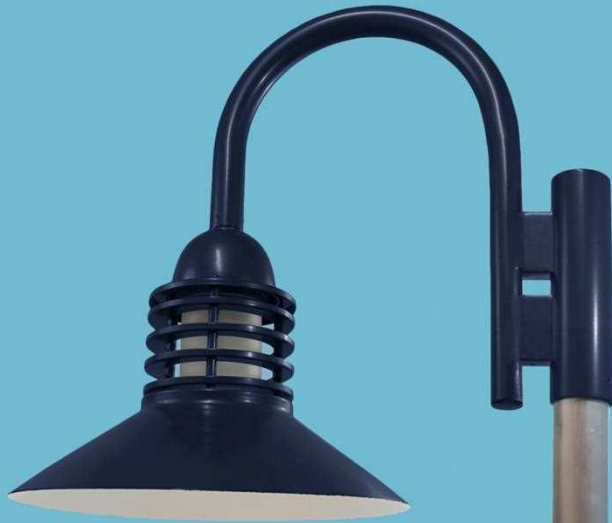
Cat# 427/20-1963 Ht. 21 1/2" Ext. 30" Dia. 20" 16" Dia. available 3" Post Fitter

Extra thick gooseneck arms with extra-large shades. These arms are almost 2" in diameter. All aluminum construction.