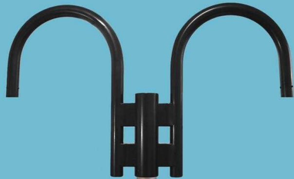
Cat# 1961 Ht. 25 1/2" Ext. 40" 3" Post Fitter