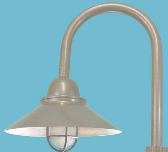
Cat# 423/20WG-1962 Ht. 28" Ext. 29" Dia. 20" 16" Dia. available 3" Post Fitter

All fixtures are available in: Incandescent(standard), Metal Halide, High Pressure Sodium, PL, & LED. Pick from any of our standard powder coated colors. See Powder Coated Color Chart. Custom colors on request. Other shades are available- see page 3B of this section.