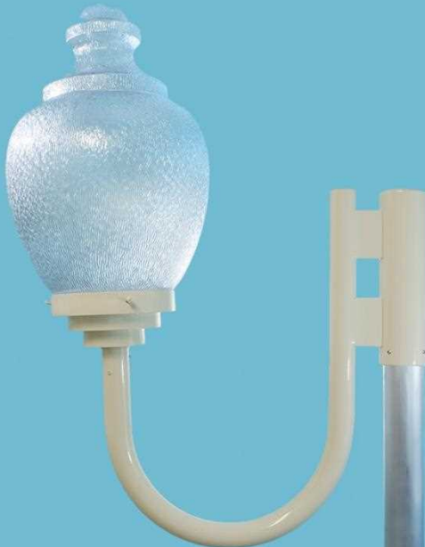
Cat# 1225/1959 Ht. 39 1/2" Ext. 27" Dia. 14" 3" Post Fitter