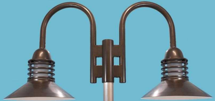
Cat# 427/20-1961 Ht. 21 1/2" Ext. 60" Dia. 20" 16" Dia. available 3" Post Fitter