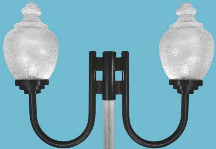
Cat# 1225/1960 Ht. 39 1/2" Ext. 54" Dia. 14" 3" Post Fitter