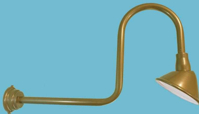
Cat# 20/12-951 Ht. 31" Ext. 52" Dia. 12 1/2" Max 200 Watt Incandescent

All fixtures are available in: Incandescent(standard), Metal Halide, High Pressure Sodium, PL, & LED. Pick from any of our standard powder coated colors. See Powder Coated Color Chart. Custom colors on request. Other shades are available- see page 3B of this section.